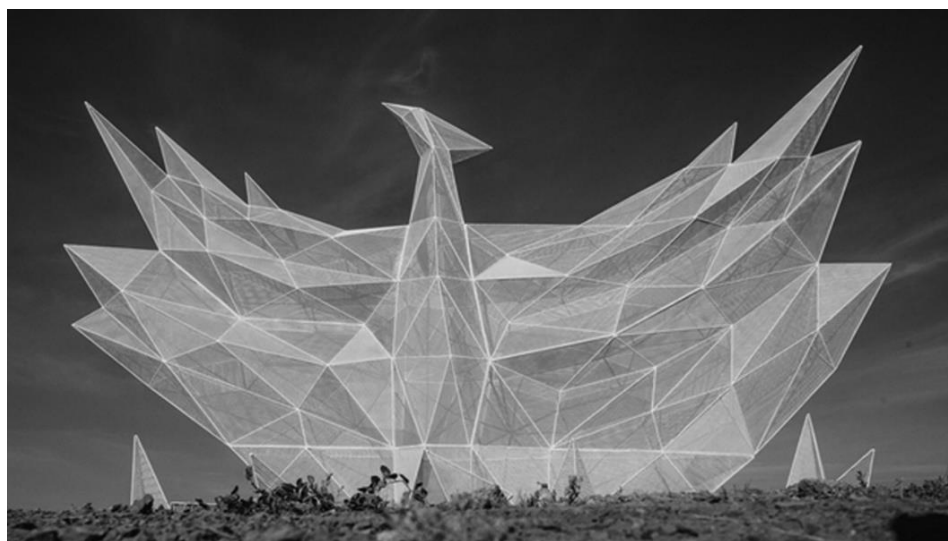
Figure 7. Sergey Pauker-Bravin. Phoenix. Metal. Crimea, Sudak, the Taurida Art Park. 2020 8

Pauker-Bravin also created the art object "Phoenix"—a luminous polygonal metal sculpture with easily readable symbols of rebirth. The artist dedicated his work to the history of Russia, which has been conquered several times, but has always revived (Figure 7).