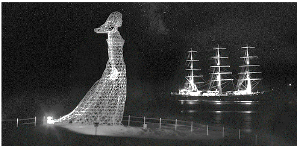
Figure 6. Sergey Pauker-Bravin. Assol. Metal. Crimea, Sudak, the Taurida Art Park. 2020 7

Several art objects were created by the famous artist and set designer Sergey Pauker-Bravin. Pauker-Bravin designed the art object "A Man Looking at the Sea" in woven metal on Kapsel Bay last year, and this year he made the art object "Assol"—a delicate girl standing on the seashore and waiting for scarlet sails. The artist created an openwork metal sculpture that is 13 meters high. External illumination makes the silhouette look particularly spectacular at night (Figure 6).