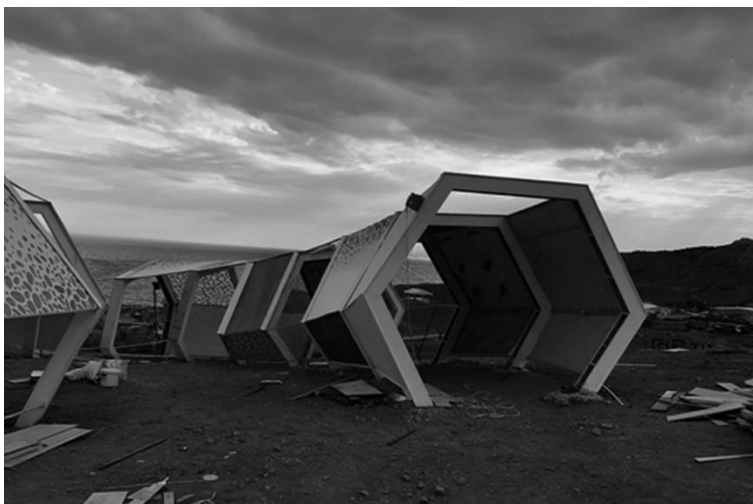
Figure 2 - The Artel of Free Artists. The art object "Taurida Stream" under construction. Concrete, polycarbonate, plywood, metal. Crimea, Sudak, the Taurida Art Park. 2020 2