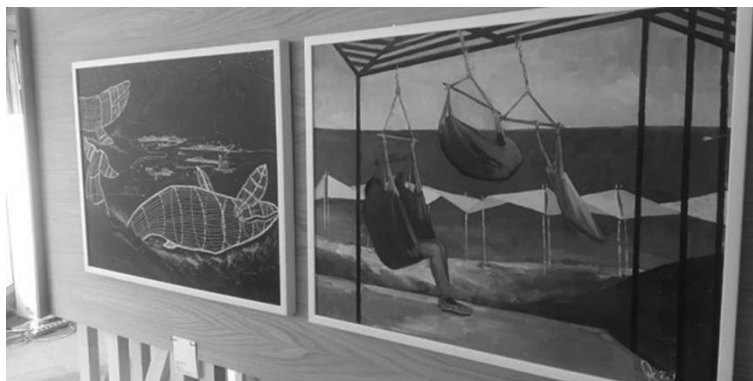
Figure 9 - Students' works at the Taurida Constans Exhibition. Crimea, Sudak, the Taurida Art Park. 2020 10