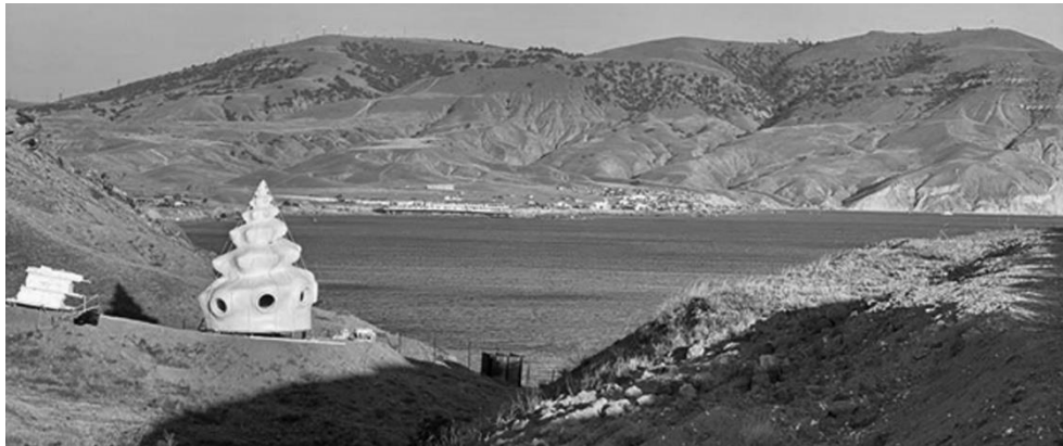
Figure 8 - Sergey Pauker-Bravin. Seashell. Crimea, Sudak, the Taurida Art Park. 2020 9

The art object "Seashell" designed by Pauker-Bravin symbolizes silence and solitude, as well as the mystery of the birth of a new life and new ideas. The parts of the art object were assembled on the spot (Figure 8).