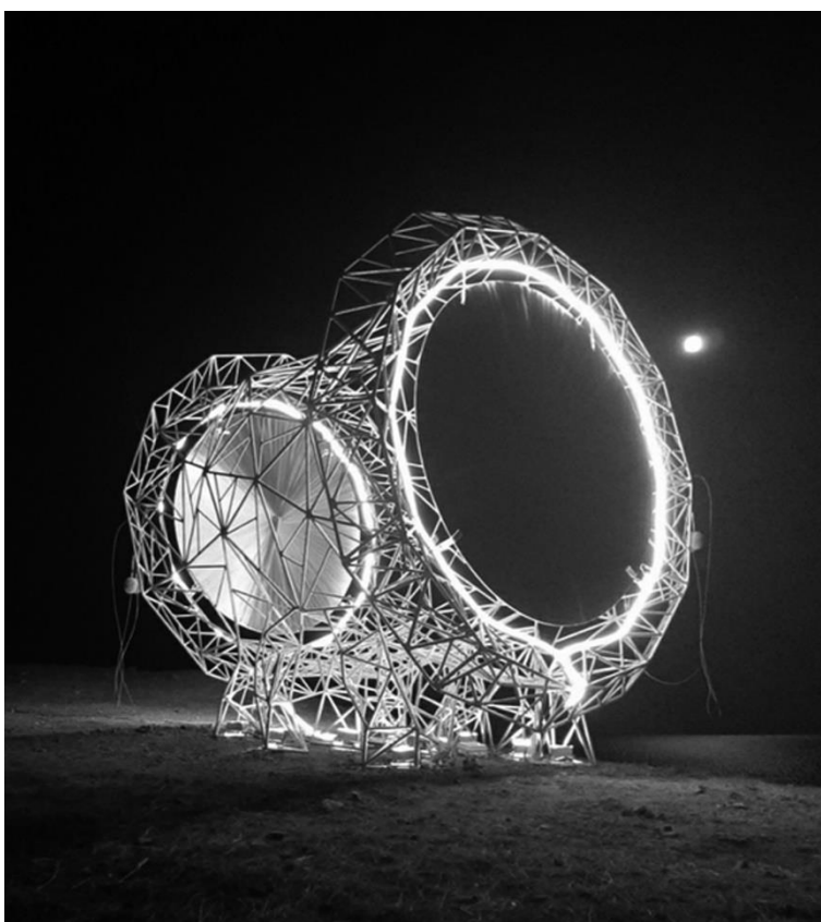
Figure 3 - The art group "Keshyu" ("Cashew"). There-There. 310×264×294 cm. Stainless steel. Crimea, Sudak, the Taurida Art Park. 2020 3