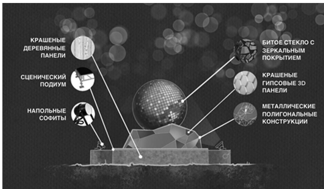
Figure 5 - Anastasia Timchuk, Orenburg. A Disco Ball with a DJ Stand. Project 6

Second place in the art competition went to Anastasia Timchuk from Orenburg with the project "A Disco Ball with a DJ Stand" (Figure 5).